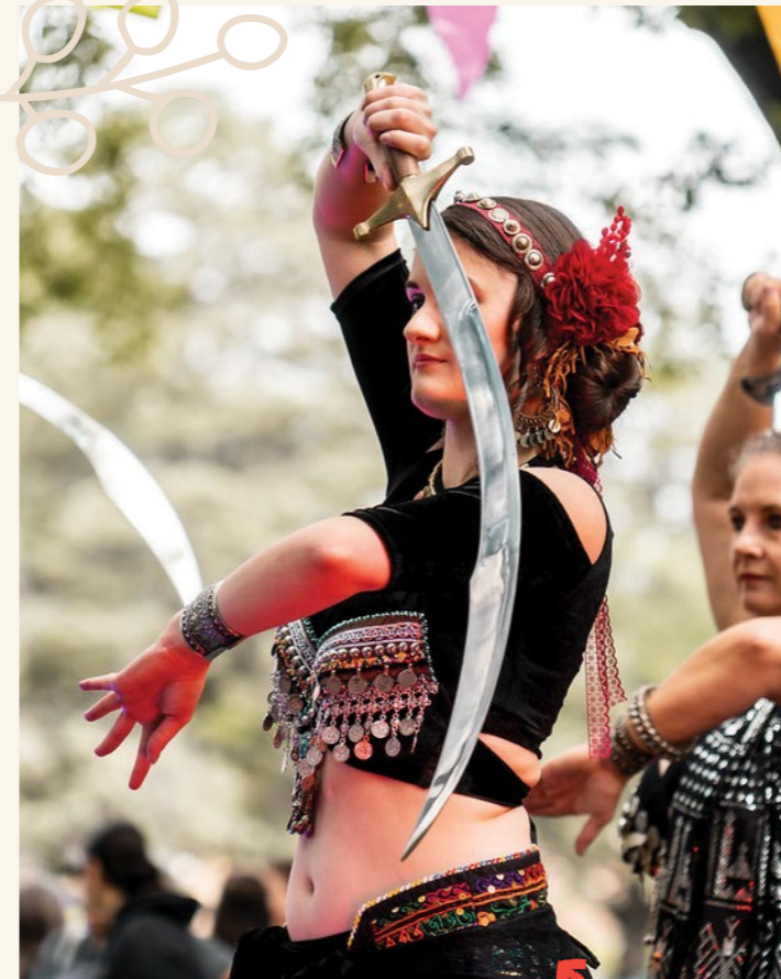
Queanbeyan Multicultural Festival