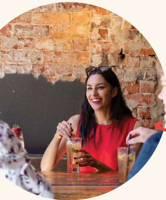
Lively pubs & clubs

And to top it all off, why not enjoy a drink with the locals at one of the city's many pubs, clubs, or restaurants? Interestingly, some of these pubs were popular watering holes for Canberrans during the prohibition period from 1911 to 1928.