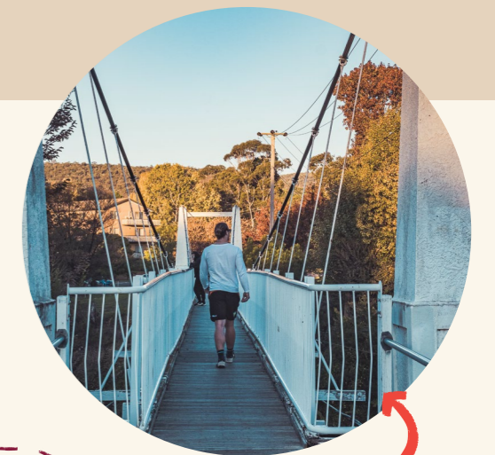
Queanbeyan River Walk

Tucked away amid stunning national parks and bushland, the historical villages of Captains Flat, Araluen, Majors Creek, and Nerriga offer a glimpse into the region's rich history and picture-perfect landscapes. From exploring old mining sites to immersing yourself in the area's old-fashioned charm, these villages promise an enchanting rural experience.