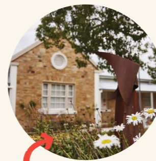
Rusten House Arts Centre

The city boasts numerous great events of all shapes and sizes throughout the year. From the annual Queanbeyan Show hosted at the Queanbeyan Showgrounds to the toe-tapping magic of Music by The River, the vibrant Queanbeyan Multicultural Festival and more, there's plenty to discover across the year.