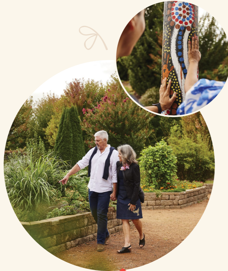
Ray Morton Sensory Park